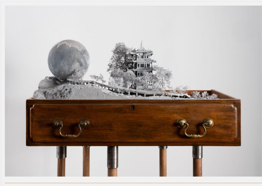
Saad Qureshi: Handful of Paradise @ I DEV / l'étrangère, Fitzrovia

Tabish Khan the @LondonArtCritic picks his top 6 Art Exhibitions to see in London during the hectic Frieze Week, and it's been expanded from his usual top 5.